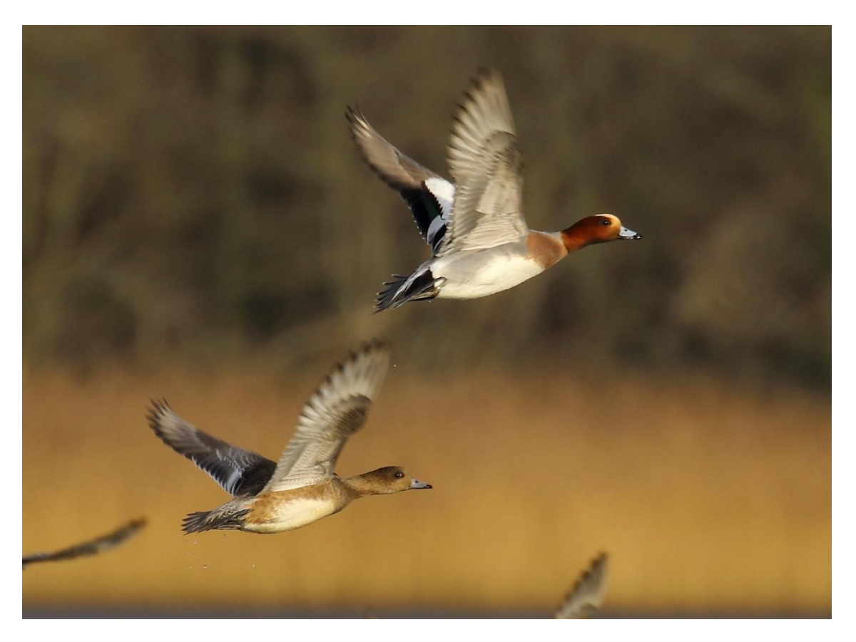
Male and Female Wigeon on 27<sup>th</sup> Jan

Welcome to the first newsletter of 2024. Spring is my favourite season at Rostherne as a sense of renewal is characterised by increasing bird song, the emergence of spring flowers and early insects scouting for nectar and nest sites.