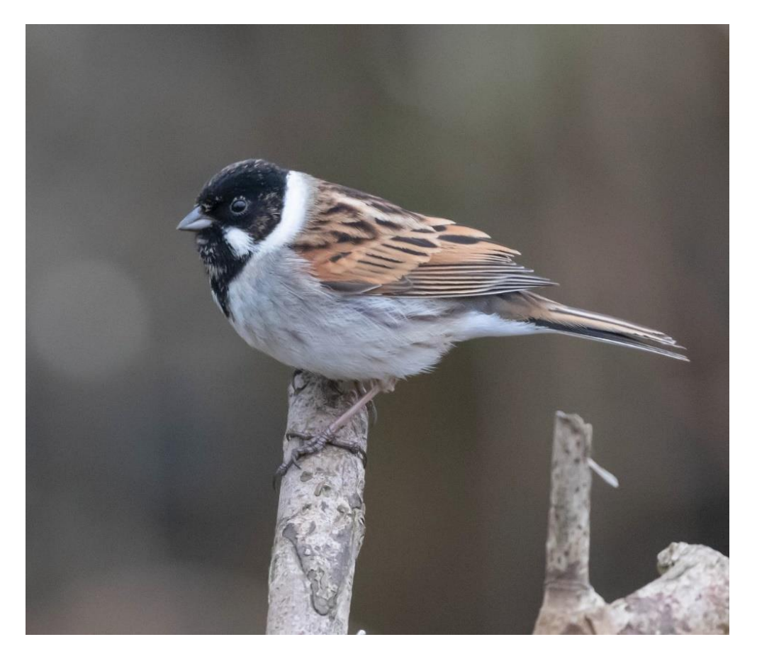
Male Reed Bunting on 10^{th} Mar