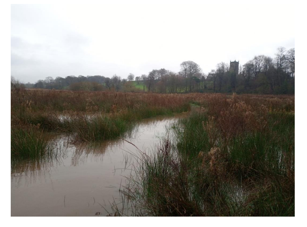
Flooding in Dolls Meadow on 3<sup>rd</sup> Jan