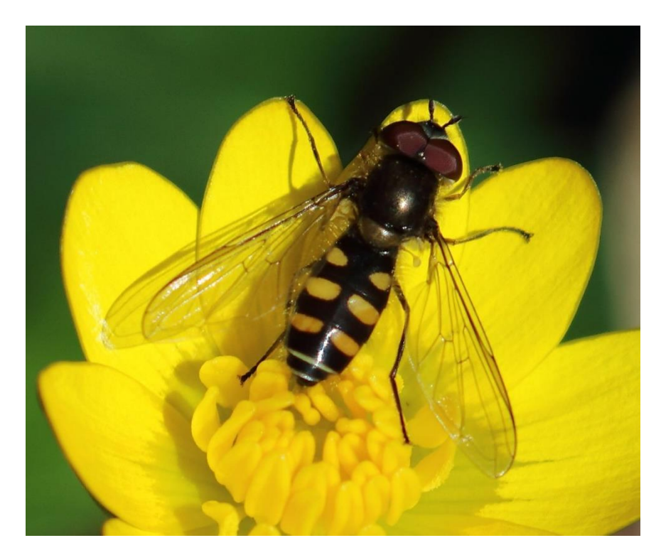
The Hairy Melangyna Hoverfly on 18<sup>th</sup> Mar