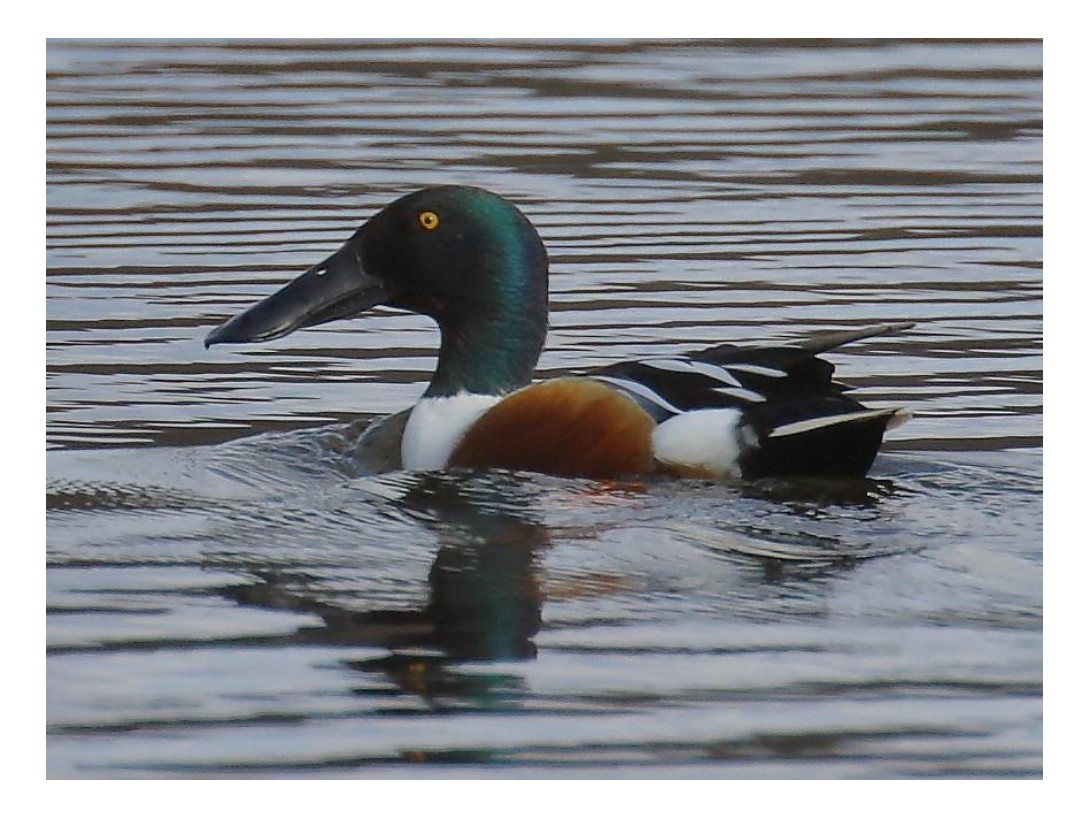
Male Shoveler on 3<sup>rd</sup> Mar