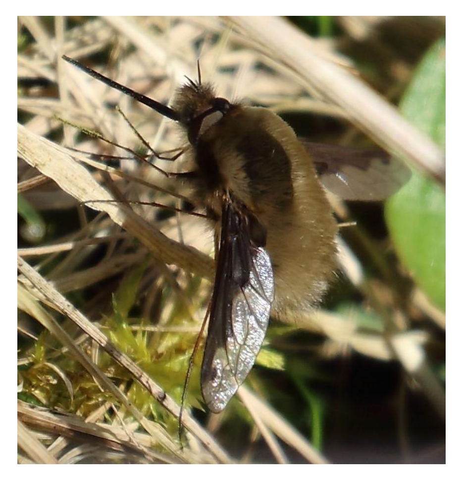
The Dark-edged Bee-fly on 16<sup>th</sup> Mar