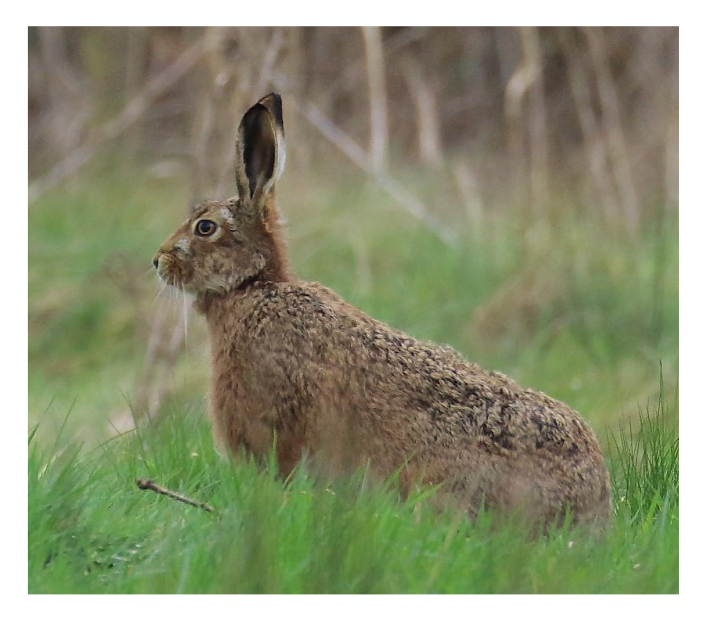
Brown Hare on 29<sup>th</sup> Feb